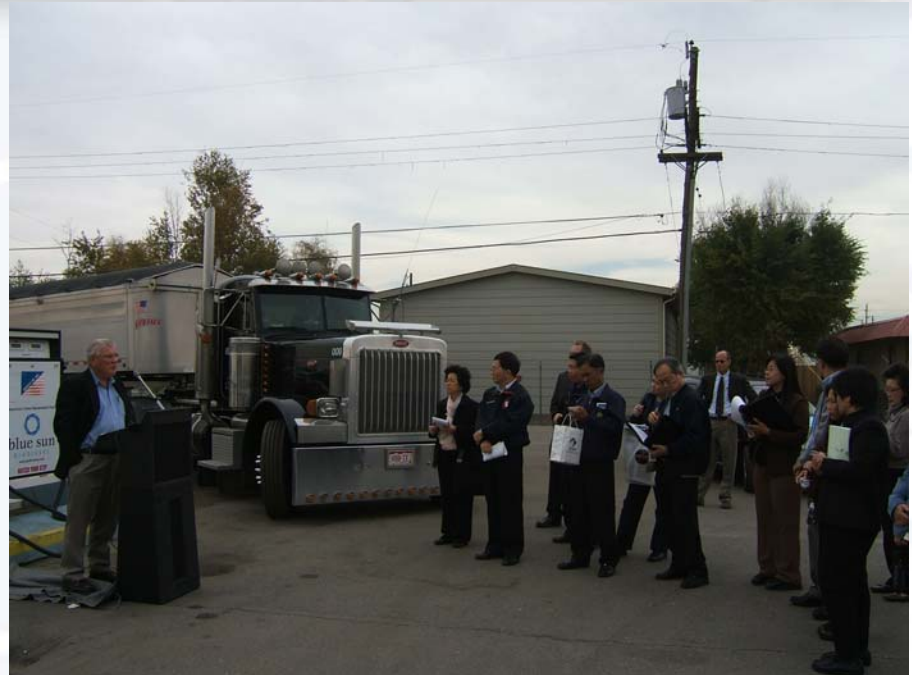
Thailand Biodiesel Technology OV