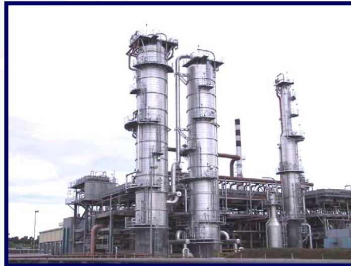
USTDA Feasibility Study - Petron Corporation isomerization unit in the Philippines